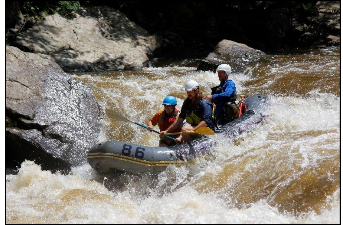
National Falls in the Upper Youghiogheny River

Several of the smaller tributaries are considered boatable after heavy rains or spring melt. American Whitewater's website offers information related to the Upper Yough boating information including flows, directions to access points, and any important alerts.