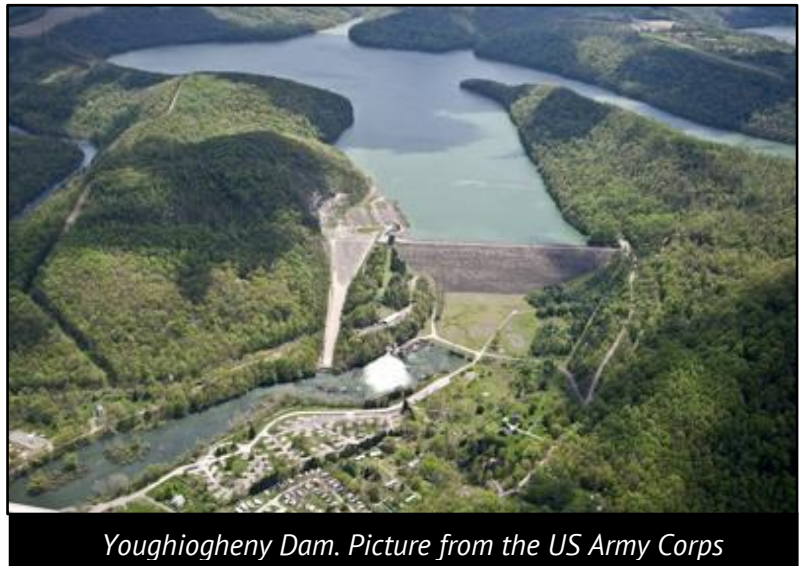
Youghiogheny Dam.

Just below Friendsville begins the Youghiogheny Lake, formed by the Youghiogheny Dam (Figure 6). It is made of dirt and rocks, 184 feet tall, and 1,610 ft wide. It is tapered from the bottom (1,000 feet) to the top (25 feet). It was built and operated by the U.S. Army Corps of Engineers. The dam is built in the Youghiogheny Valley, 59 miles down from the source and 1.2 miles above Confluence. The dam's purpose is to make low flows higher and high flows lower, protecting Pittsburgh from flooding, helping industry by maintaining levels for barges, abating pollution, and inadvertently supporting whitewater recreation below Ohiopyle.