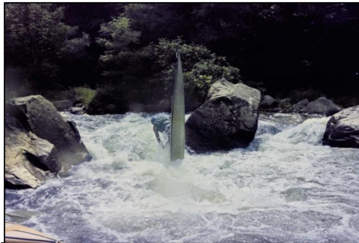
Dave Demaree throwing an ender at the rapid Powerful Popper on the Upper Yough, 1974.

River access did not just happen. In the mid-1970s, to protest the recent designation of the Upper Youghiogheny as a State Scenic River, local landowners began harassing paddlers who attempted to run this stretch. Connected by a CB network, locals acted when cars bearing boats were spotted on roads approaching the Sang Run Bridge. Crowds materialized at the bridge. Rocks were thrown.