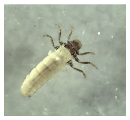
Above: This caddisfly is one of many macroinvertebrates that live in Indian Creek

on the results of this sampling, we found numerous organisms indicative of a healthy stream. We continue to find an increase in the number and diversity of the bugs we find including those with a low tolerance for pollution. These results tell us that our mine drainage treatment systems are functioning as planned and are allowing for the return of aquatic life in Indian Creek.